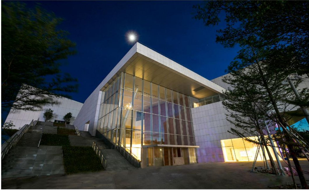
The 'social aspects' of the building were the most important part of the design for the architects