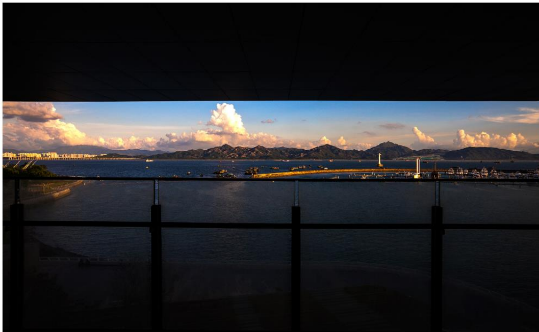
Once a fishing village, Shenzhen transformed itself into an industrial powerhouse