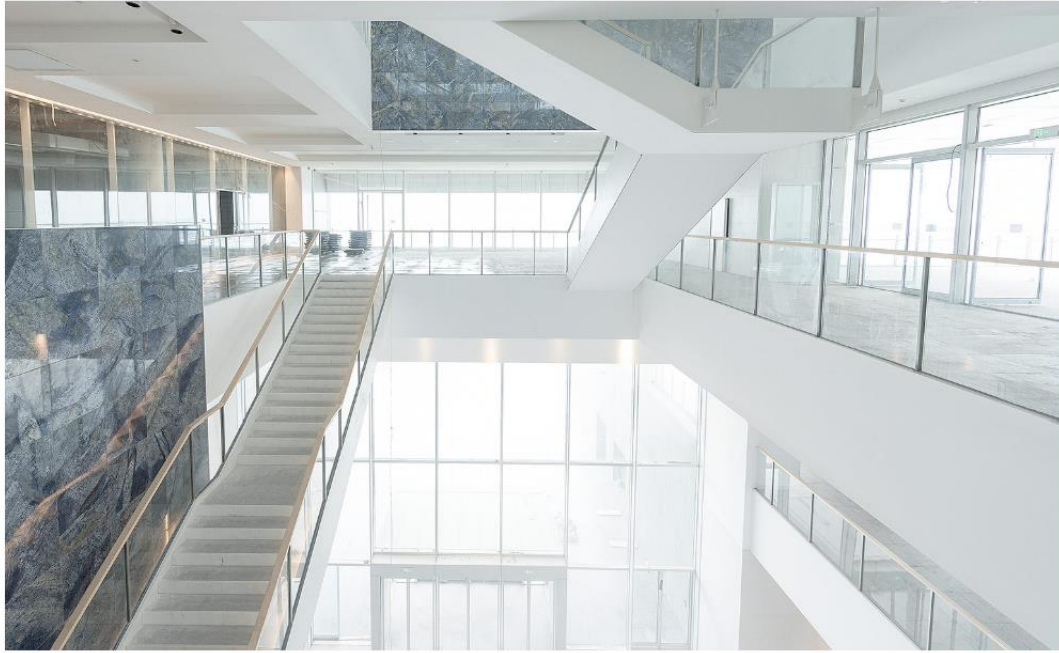
The interior is made up of three light-filled lofty atriums