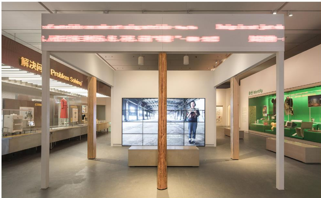
The three galleries, include one designed by Sam Jacob Studio which is designed to house over 250 design objects from the V&A collection.