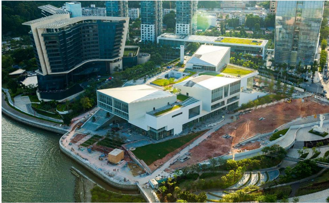
The building features three distinctive white aluminium cantilevered 'volumes' that protrude from a cubic form