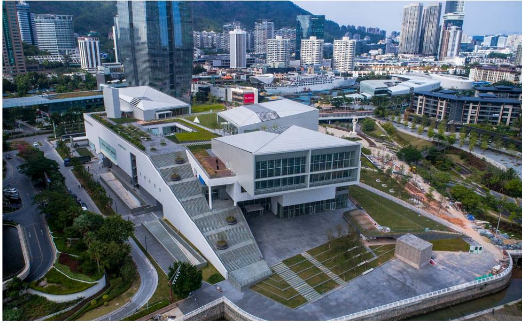
An urban podium is integrated into the building's façade